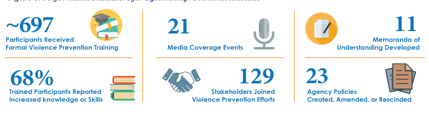
Figure 6. Performance Indicators for System Improvement Activities

System improvement activities promote systems and policy enhancements by addressing youth violence at state and local levels. Activities include stakeholder collaborations, policy and procedure changes, media coverage, and training events. A total of 129 new stakeholders joined grantees in violence prevention efforts, including government agencies, community groups, and nonprofit organizations, resulting in the development of 11 new memoranda of understanding, and 23 policies created, amended, or rescinded (figure 6). Approximately 697 individuals received training on topics such as risk, resiliency, and protective factors; trauma and its impact on children, youth, and families; adolescent development principles and how to apply them; and strategies for violence prevention. Of the training participants sharing post-training feedback, 68 percent reported increased knowledge or skills (n = 455).