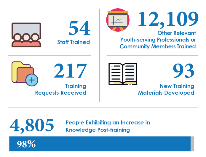
Figure 3. Training Activities

<sup>3</sup> U.S. Department of Justice, Office of Justice Programs, Office of Juvenile Justice and Delinquency Prevention. VOCA Performance Report January–June 2019. <u>https://ojjdppmt.ojp.gov/</u>