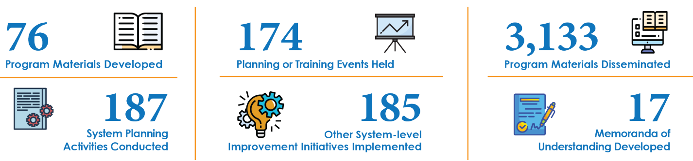
Figure 2. System Planning Activities

System planning activities help strengthen state chapter organizations and enhance coordination among agencies. During the January–June 2020 activity period, the number of system planning activities conducted increased (from 103 to 187) when compared to the previous activity period. System planning activities included the creation of task forces or interagency committees, meetings, and needs assessments. VOCA grantees developed 76 program materials, 90 fewer than the previous activity period (July–December 2019).<sup>3</sup> Program materials may include program overviews, client workbooks, and lists of local service providers. Grantees changed or rescinded eight program policies. During this activity period, grantees held more planning/training events and disseminated fewer program materials than the previous period; however, grantees implemented 92 more system-level improvement initiatives.