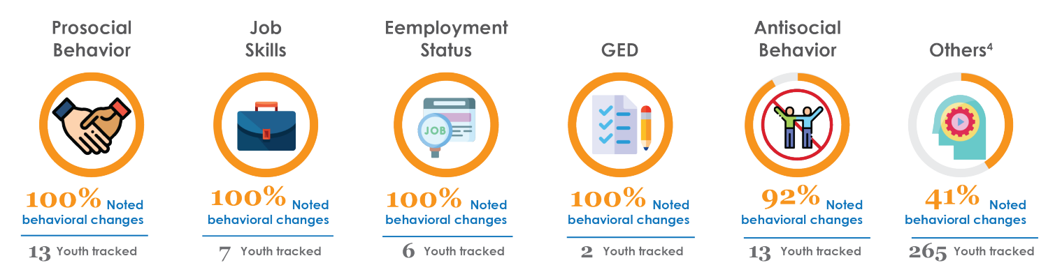
Figure 3. Outcome Percentages for the Specified Target Behaviors

Youth participating in THWC programs are tracked for short-term behavior changes to measure the program's impact on performance in several targeted areas, such as substance use, school attendance, social behaviors, and cultural skill building. During the January–June 2021 activity period, 100 percent of tracked youth demonstrated the most improvement in prosocial behavior, job skills, employment status, and GED (see figure 3). Overall, 49 percent of program youth tracked exhibited a desired change in a targeted behavior.