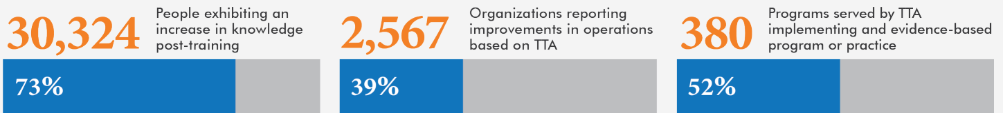
Figure 3. Training and Technical Assistance Outcomes