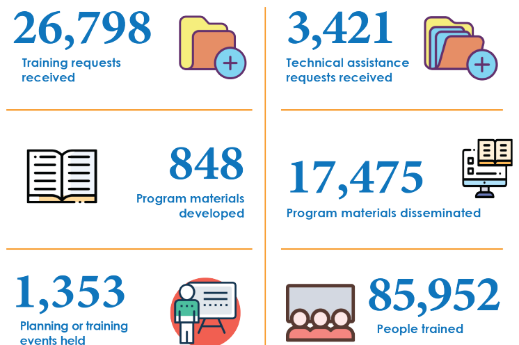
Figure 2. Training and Technical Assistance Activities

TTA grantees focus on the planning, development, and delivery of training activities, such as in-person or virtual training workshops, producing toolkits, and developing job aids and apps, all designed to achieve specific learning objectives. TTA grantees aim to enhance child-serving, juvenile justice systems by fostering the application of positive and innovative approaches to lowering juvenile delinquency, improving children’s welfare, and reducing child victimization. Figure 2 presents data on program training activities, which include TTA requests received, people trained, and program materials developed. Collectively, grantees received a total of 26,798 training requests and 3,421 requests for technical assistance during the activity period.