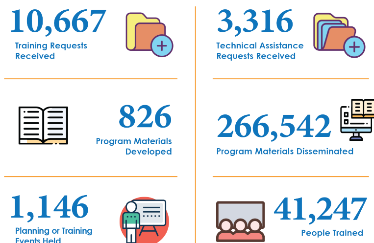
Figure 2. Training and Technical Assistance Activities

TTA grantees focus on the planning, development, and delivery of training activities such as in-person or virtual training workshops, producing toolkits, and developing job aids and apps, designed to achieve specific learning objectives. TTA grantees aim to enhance child serving and juvenile justice systems by fostering the application of innovative approaches to juvenile delinquency, child welfare, and victimization. Figure 2 presents data on program training activities, which include TTA requests received, people trained, and program materials developed. Collectively, grantees received a total of 10,667 training requests and 3,316 requests for technical assistance during the activity period.