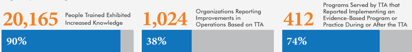
Figure 3. Training and Technical Assistance Outcomes