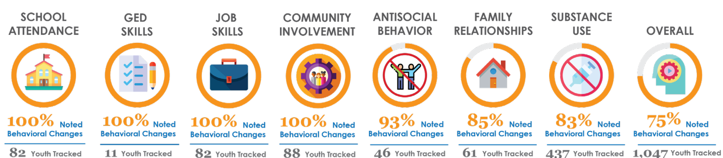
Figure 3. Short-term Outcome Percentages for the Specified Target Behaviors