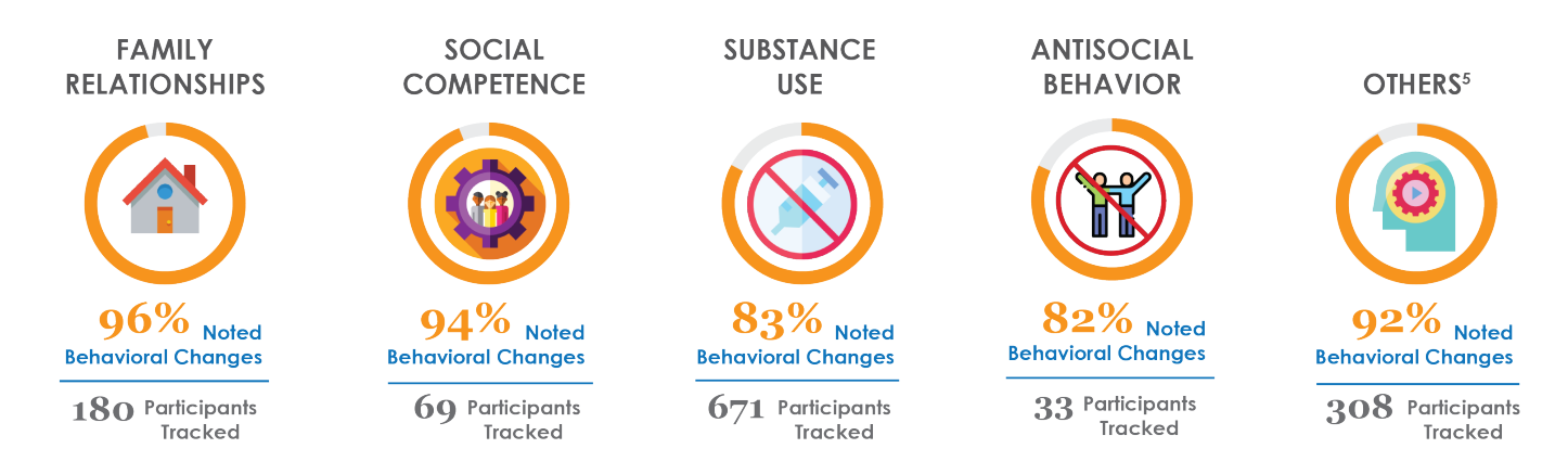
Figure 4. Short-Term Outcome Percentages for the Specified Target Behaviors

To measure program impact, FDC programs report on parents' or guardians' behavior changes in several targeted areas. As shown in figure 4, the largest short-term improvement among parents or guardians was among family relationships, social competence, substance use, and antisocial behavior during the July–December 2019 activity period. Of those monitored for substance use, 83 percent reduced substance use in the short term. Overall, 88 percent of parents or guardians showed a behavioral improvement in the short term.