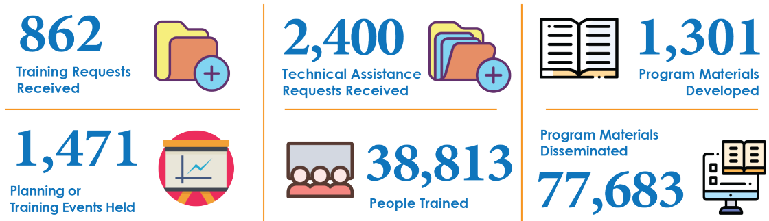
Figure 2. Training and Technical Assistance Activities