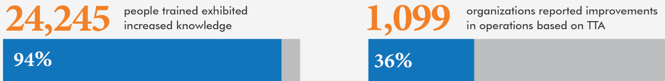
Figure 3. Training and Technical Assistance Outcomes

The primary goals of TTA grantees are to increase knowledge of their specific program areas, improve program operations based on TTA, and play a central role in the national effort to improve the juvenile justice system overall. Figure 3 presents data on increased knowledge and improvements in program operations. Ninety-four percent of individuals exhibited increased knowledge of the program area after receiving training, which is a 12 percent increase from the prior reporting period. 3