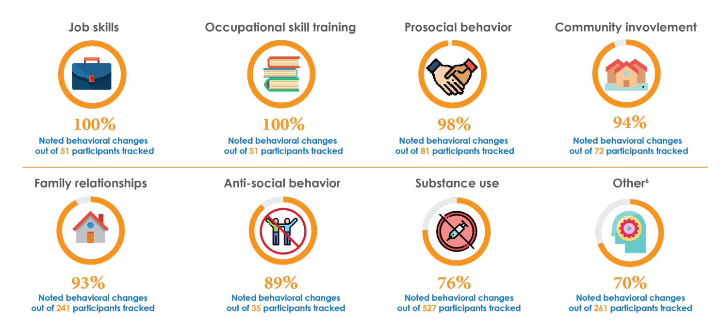
Figure 4. Short-Term Outcome Percentages for the Specified Target Behaviors

To measure program impact, FDC programs report on parents' or guardians' behavior changes in several targeted areas. As shown in Figure 4, the largest short-term improvement among parents or guardians was among job skills, occupational skill training, prosocial behavior, and community involvement during the July–December 2021 activity period. Of those monitored for substance use, 76 percent reduced substance use in the short term. Overall, 79 percent of parents or guardians showed a behavioral improvement in the short term.