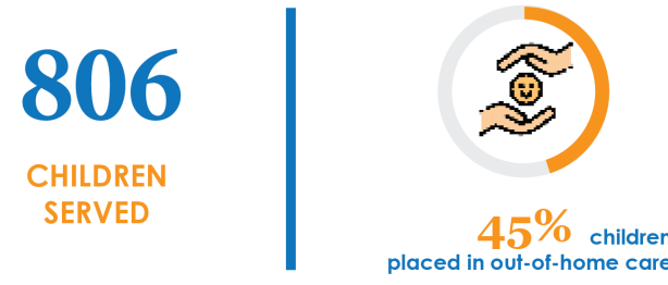
Figure 8. Child Welfare Outcomes

The goal of FDCs is to maintain or restore a parent's custody of their child(ren. When successful, FDCs result in family reunification. However, if reunification is not in the child's best interest, FDCs develop alternative placement plans for children. Of the 806 children supported by FDCs during the July-December 2021 activity period, grantees placed 363 in out-of-home care and reunited 115 children<sup>8</sup> with their parents (figure 8). On average, children remained in out-of-home care for 236 days. FDCs terminated parental rights for 1 percent of parents or guardians enrolled in an FDC during the activity period (n = 5).