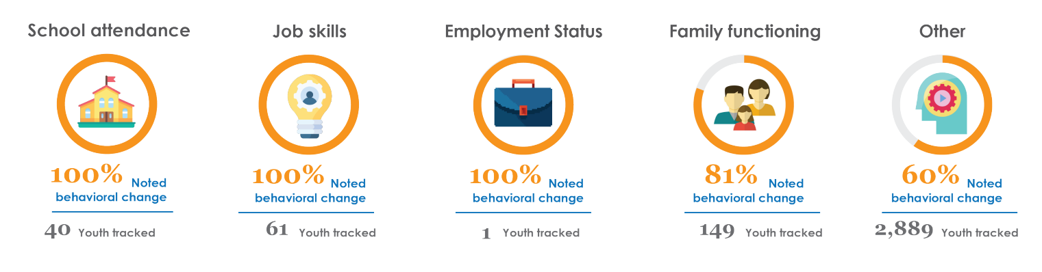
Figure 6. Short-term Outcome Percentages for the Specified Target Behaviors

Targeted prevention and intervention awards focus on improvement of youth behavioral outcomes. Grantees report on behavioral changes in several targeted areas (e.g., family relationships and school attendance). During the July– December 2021 activity period, for youth receiving services while in the program or within 6 months of exiting, grantees observed improved school attendance, job skills, employment status, and family functioning (figure 6). Overall, 62 percent (n = 1,942) of youth showed a positive behavioral change in the short term.